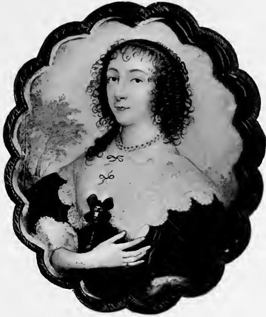
QUEEN HENRIETTA MARIA BY JOHN HOSKINS, THE ELDER